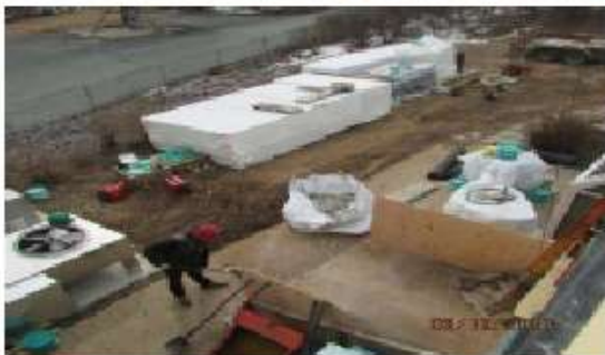
View of site from roof. Worker cleaning up as they proceed.