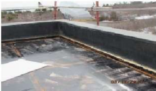
View of roof along parapet wall.