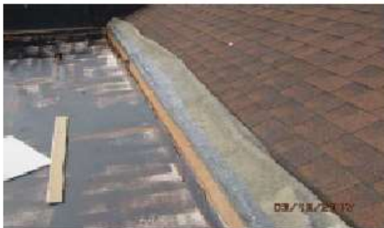
All openings within the gypsum are sealed with tape.