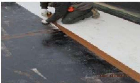
Joints of gypsum boards being sealed with tape.