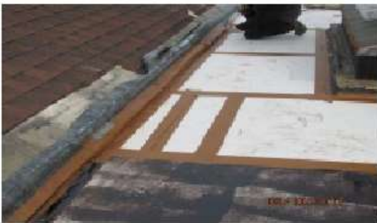
Joints of gypsum boards being sealed with tape.