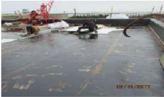
View of roof surface.