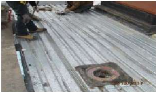
Flutes of decking being cleaned out.