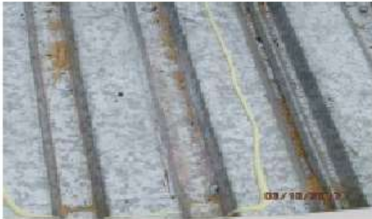
Flutes of decking are being cleaned out.