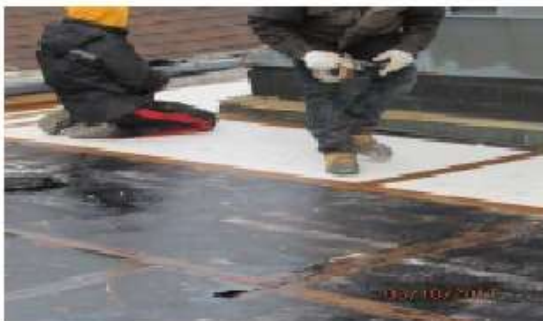
Joints of gypsum boards being sealed with tape.