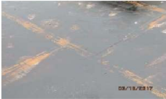
All openings within the gypsum are sealed with tape.