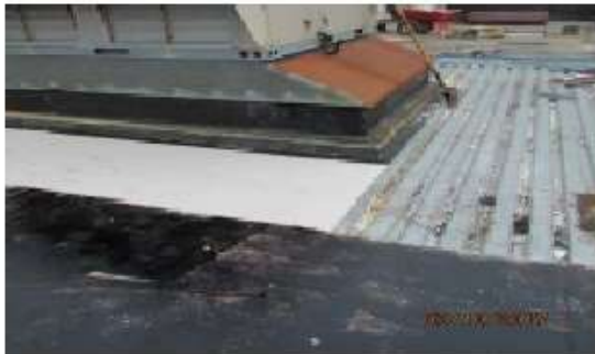
New gypsum being installed.