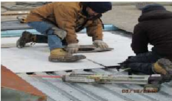
Installation of gypsum around roof drain.