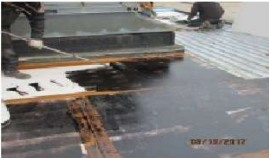
Priming gypsum surface.