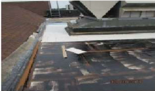
New gypsum being installed.