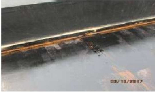
All openings within the gypsum are sealed with tape.