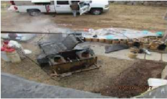
Work site below the roof.